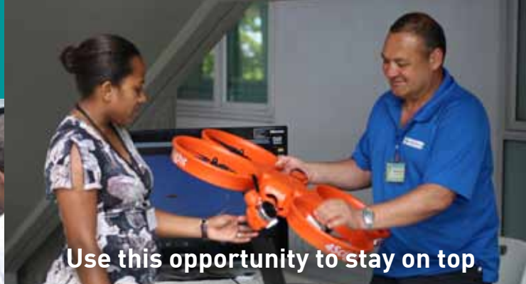
Use this opportunity to stay on top.

Out of 72 presentations made at the Conference, 21 were in and around open source GIS tools and data. #PacGISnRS #FOSS4G @spc_live