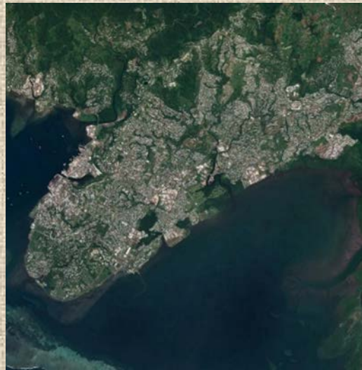
Suva Peninsula Today.