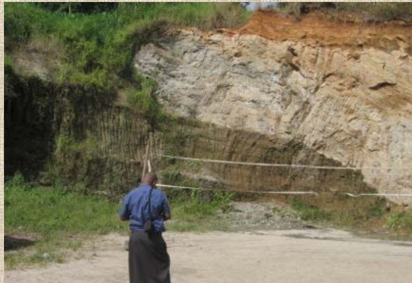
Road cut through the Veisari sandstone.