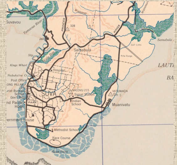
Suva Peninsula 1943.