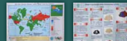
Some entries from 2016