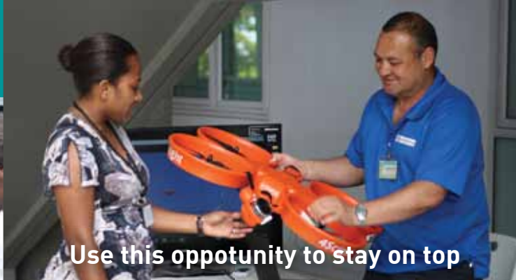
Use this opportunity to stay on top

#PacGISnRS @PacGISnRS - 30 Nov 2016 Out of 72 presentations made at the Conference, 21 were in and around open source GIS tools and data. #PacGISnRS #FOSS4G @spc_live