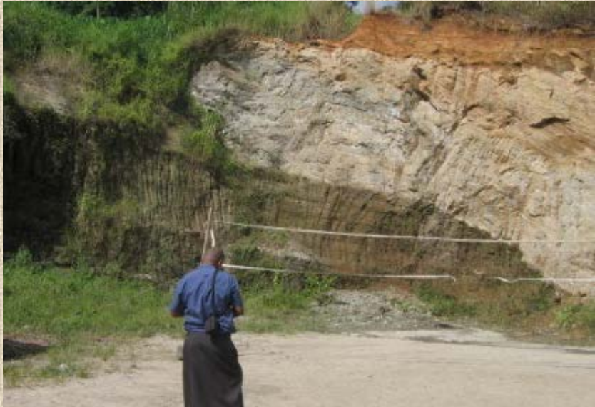
Road cut through the Veisari sandstone.